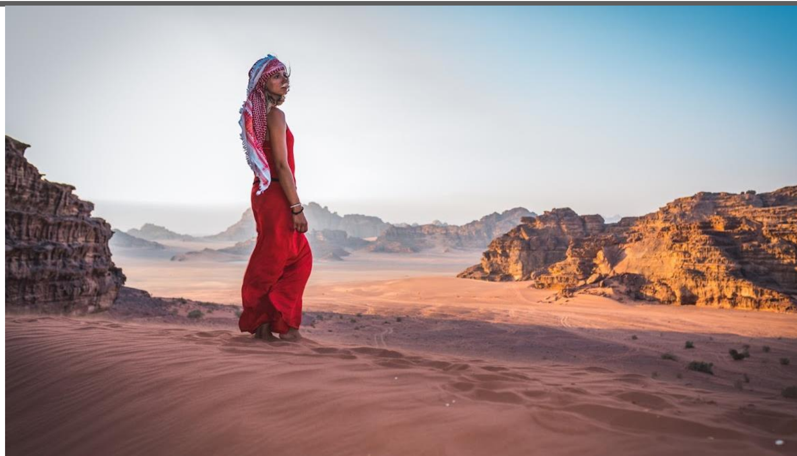
Wadi Rum desert Jordan - Valley of the Moon.

We initiate the day with a yoga session.